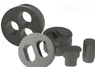
Multi-Hole Seals p.29