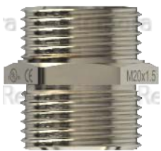
• Nitrile O-Ring