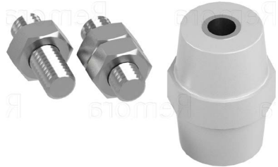
EI03 = Insulator complete with 2 studs and 3 nuts EI = Insulator only