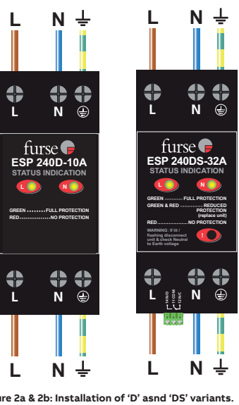
Figure 2a & 2b: Installation of 'D' asnd 'DS' variants.

3.5 Position the ESP Protector at the preferred location on the DIN rail and press the protector back to release the springs. The protector locks into place.