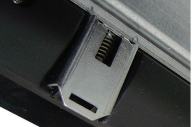
Figure 3a & 3b: Innovative spring loaded DIN foot shown open and locked in place.