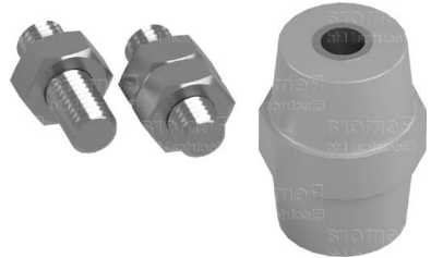
EI03 = Insulator complete with 2 studs and 3 nuts EI = Insulator only